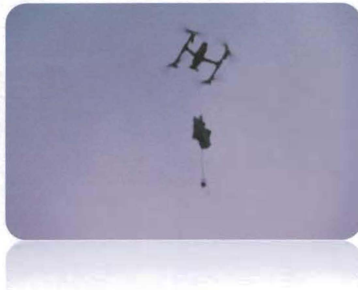
Drone carrying the measuring equipment above the Bosnian Pyramid of the Sun