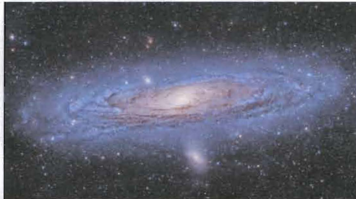
From the Centre of the Univers to the Earth, and back