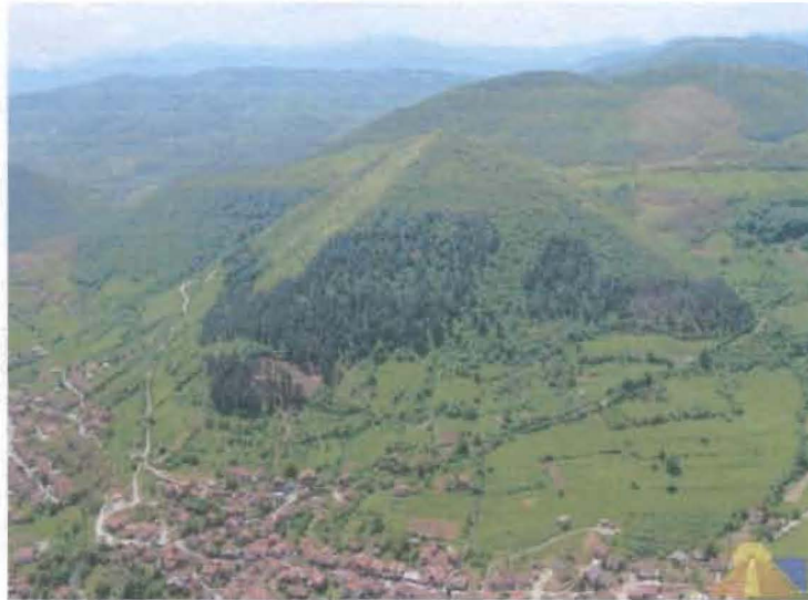
Bosnian Pyramid of the Sun

Thereby, the Bosnian Pyramid of the Sun, on our small mother Planet, is a link in the cosmic Internet.